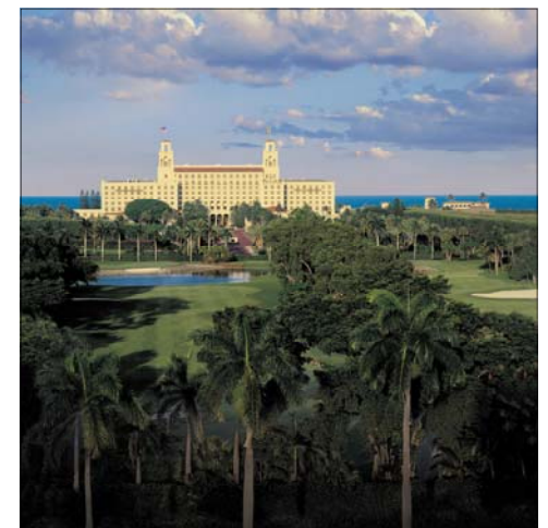
2006 Congress of the Americas — The Breakers Hotel, Palm Beach, Florida